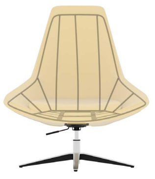
Armchair with headrest

Inner structure: Ø 10 mm steel rod welded to metal plates.